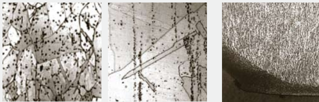
CuCrZr before and after annealing at 900°